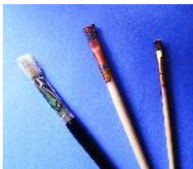
"Artsy"