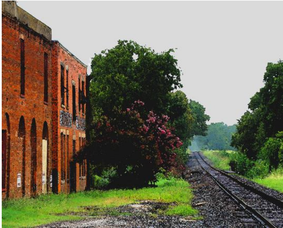
"The Railroad Building" by Christopher Woods; http://christopherwoods.zenfolio.com/