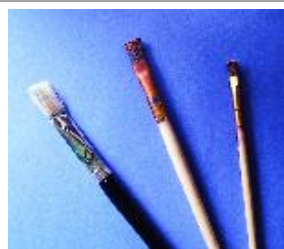
"Artsy" N.M.B Copyright 2008

8% commission 60 return days auto-deposit JOIN NOW!