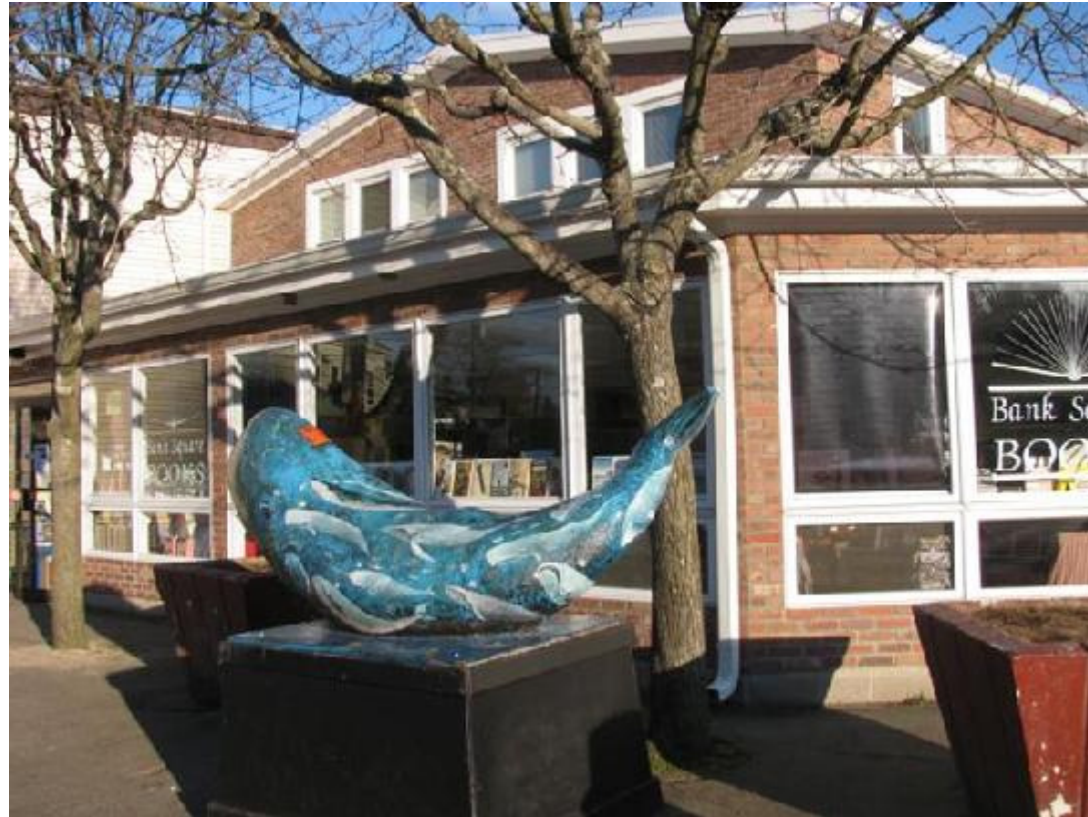
Bank Square Books; http://www.banksquarebooks.com/