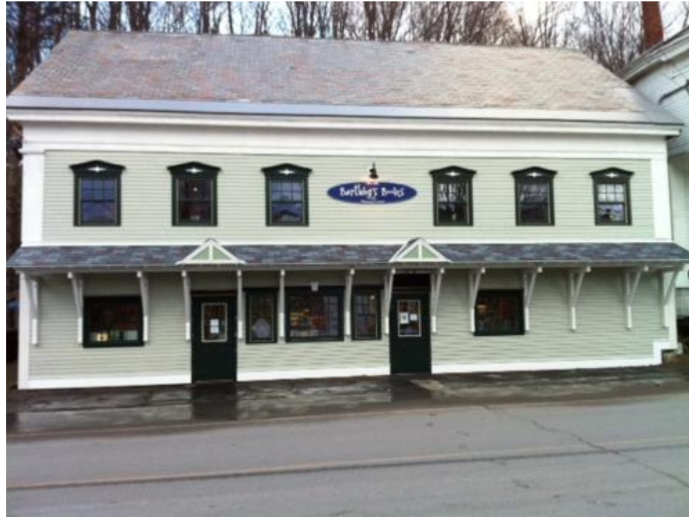
Bartleby's Books; http://www.bookcellarvt.com/

Bartleby's Books turned 22 this year and is located in the resort community of Wilmington, VT. The town has a sizable second home owner population which creates a heightened and diverse audience for author events particularly in winter and summer months. Bartleby's is situated in the center of downtown in a three-story building which we have worked to promote as a community center, hosting classes and offering space for healing practitioners on the upper floors. After suffering a devastating flood in August of 2011, Bartleby's is back open and newly renovated.