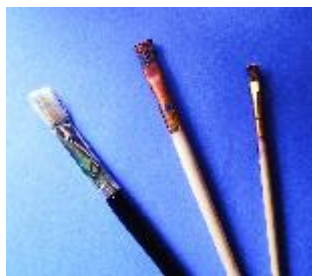
"Artsy"