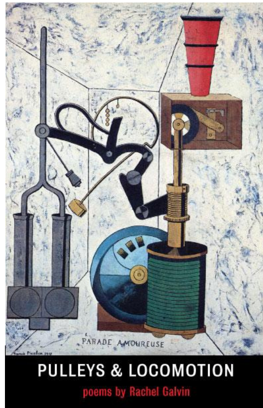
Pulleys and Locomotion Cover Image