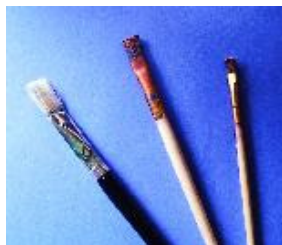
"Artsy"