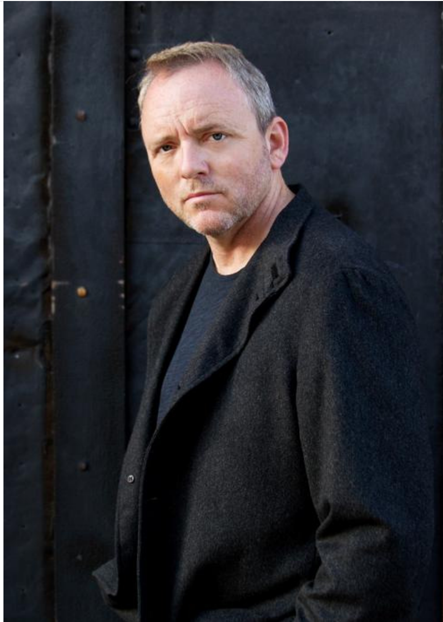
Dennis Lehane