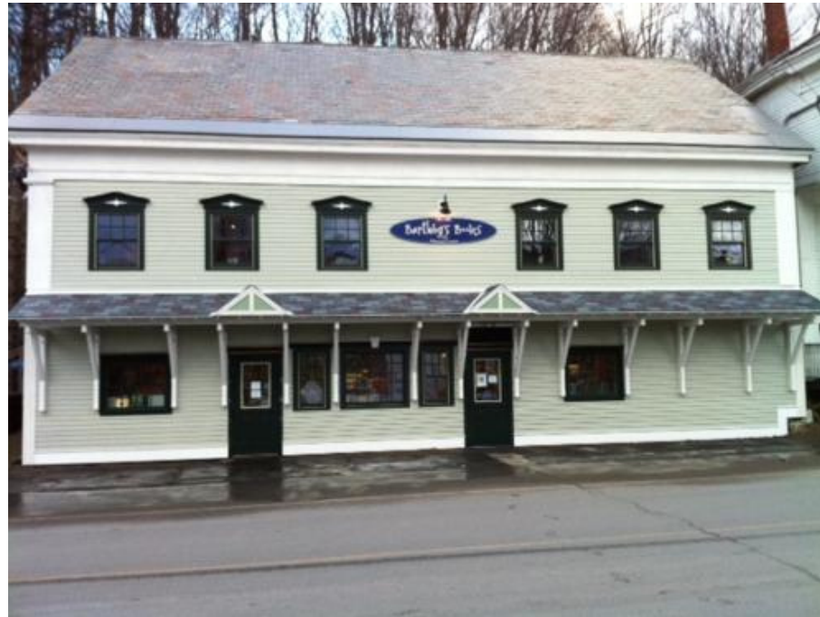
Bartleby's Books; http://www.bookcellarvt.com/

Bartleby's Books turned 22 this year and is located in the resort community of Wilmington, VT. The town has a sizable second home owner population which creates a heightened and diverse audience for author events particularly in winter and summer months. Bartleby's is situated in the center of downtown in a three-story building which we have worked to