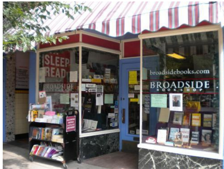
Broadside Books; http://www.broadsidebooks.com/