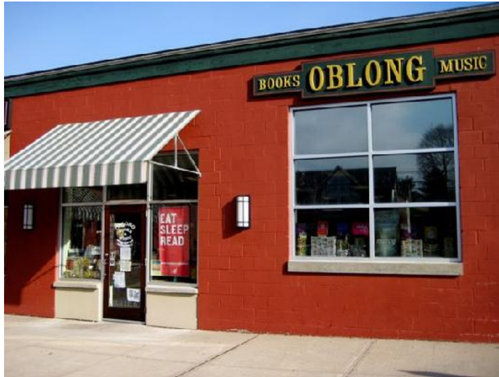
Oblong Bookstore Image

Oblong Books & Music - Millerton & Rhinebeck, NY - http://www.oblongbooks.com